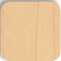
HARDROCK MAPLE* M10/L10