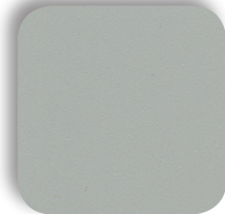
SMOKE GRAY* M70/L70