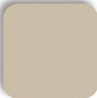
OYSTER GRAY* M64/L64