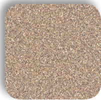
BEIGE GRANITE^ M90/L90