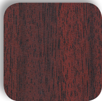
SAPELLI MAHOGANY* M25/L25