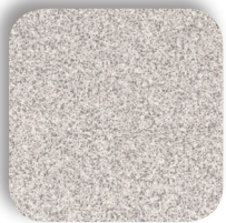
CACTUS STAR* M85/L85