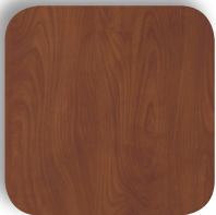
WILD CHERRY* M21/L21