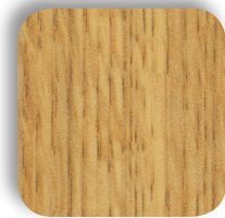
FINNISH OAK* M15/L15