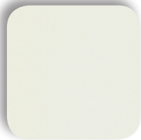
ANTIQUE WHITE* M46/L46