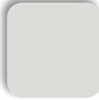
GRAY MIST T86