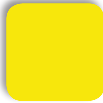
SAFETY YELLOW T93