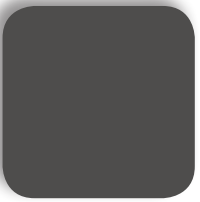
DARK GRAY METALLIC T45