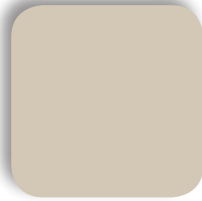
WARM BROWN* T22