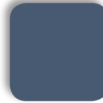
TECH BLUE T42