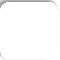
PURE WHITE T94