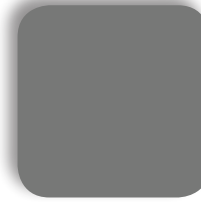
MEDIUM GRAY METALLIC T23